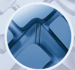
Measuring point location

REPAIRABILITY AND RETREADABILITY MAXIMIZED THANKS TO THE EXTREME RELIABILITY OF THE CASING (##)